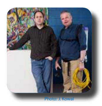
The Cleaning Solution is a contract cleaning company with a focus on quality, health and environmental safety. Their mandate is to help individuals recovering from mental illness who are ready and able to return to the workplace.

is a general contractor and construction manager located in Winnipeg, Manitoba. It was initiated by Community Ownership Solutions Inc, a community development corporation (CDC) with a mandate to create quality jobs for low income people in Winnipeg's inner city.