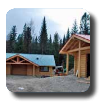
Blue Lake Forest Education Society (BLFES) is a nonprofit, charitable organization that focuses on providing education opportunities to children and youth through experiential learning programs.

The feasibility study that Blue Lake conducted played a major role in the development of the project we are currently working on. I have always thought that one of the greatest strengths as a Society is Blue Lake's ability to plan and carefully analyze a situation before moving forward. However, going through the process of the feasibility study forced us as an organization to ask questions that we would not normally think of. The social enterprise that we were considering was constructing a lodge and training centre to facilitate forest and environment education programs as well as job training programs. When not being used for these purposes it would be rented out to private user groups to generate some extra revenue for the Society. We thought we had a pretty good idea of what we wanted in terms of the size and location of the building and we thought that our next step would be to round up the funding and proceed. After receiving some funding from Enterprising Nonprofits and the Kootenay Woodlot Education Society to complete a feasibility study we thought that it would be wise to put things on hold until after we had completed the feasibility study. Honestly I didn't think that too much would change, but that the study would help to confirm what we already thought would be the best route to go. I was wrong. We carefully looked at the social, environmental and economic factors associated with this construction project and I started discussing