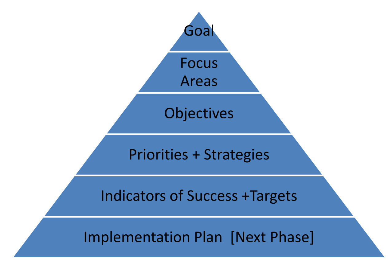
Figure 2: Regional Homelessness Plan Overview

The figure below shows the overall structure of this RHP.