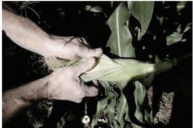
AFTER MANY MEETINGS, PHONE CALLS, AND NEGOTIATIONS; OWNERSHIP OF THE FARM TRANSFERRED TO FARMFOLK CITYFOLK IN SEPTEMBER 2016.

While negotiations were underway, community members that had been volunteers on the farm formed the “Lohbrunner Community Farm Co-op”, a service co-op operating under